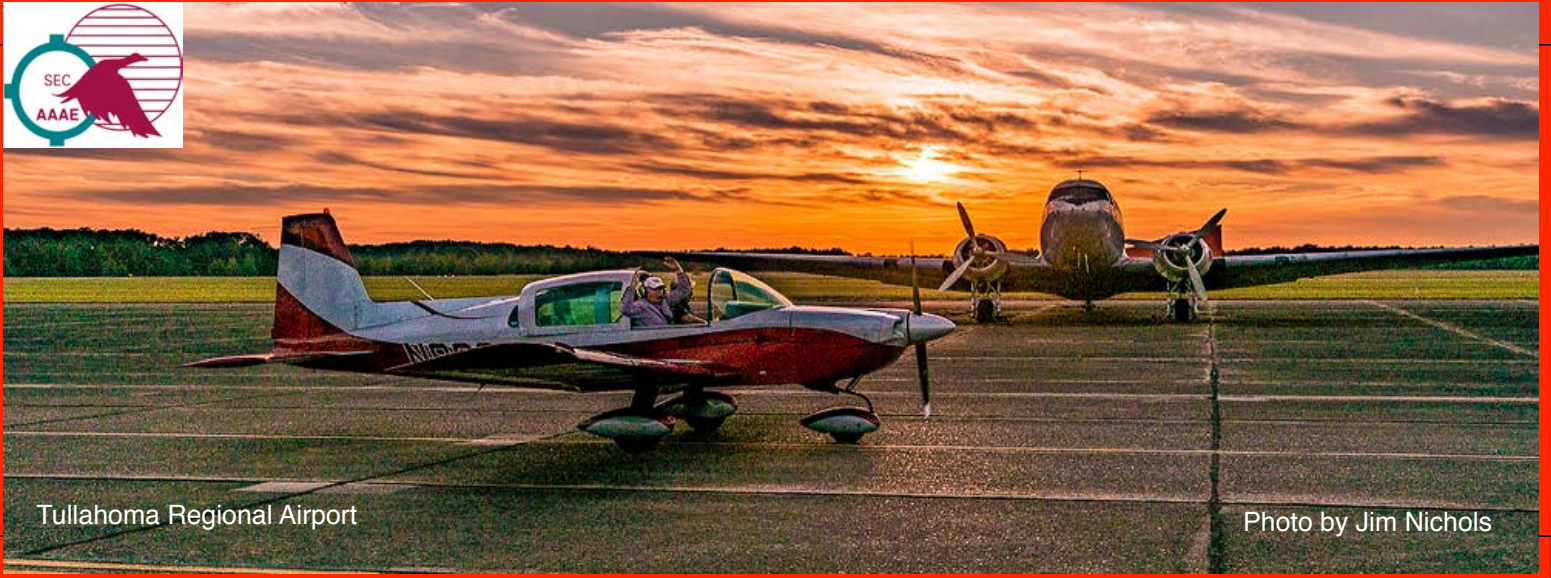
Tullahoma Regional Airport