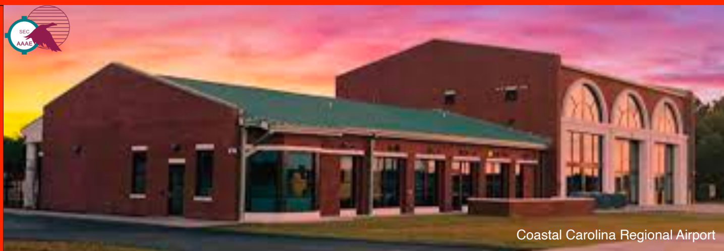
Coastal Carolina Regional Airport